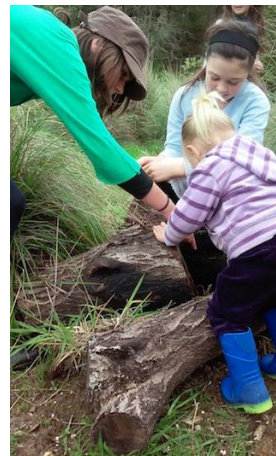
Where Are You?