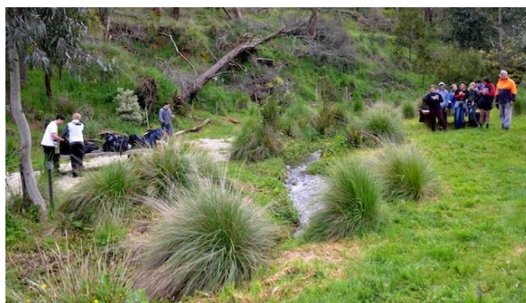
Gettin' Dirty Morning Tea