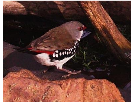
Firetail Finch - Victorian Natives photo