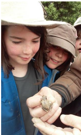
Ewing's Trees Frog