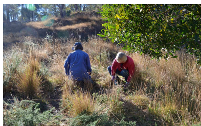
Removing Gorse by hand