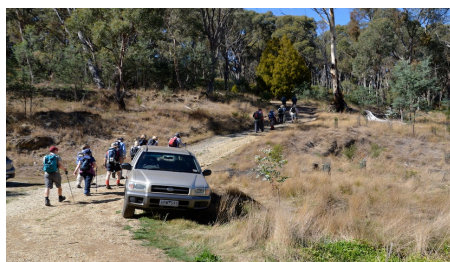
Walkers seen enjoying The Hill on 29th March