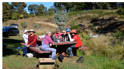
A well earned morning tea